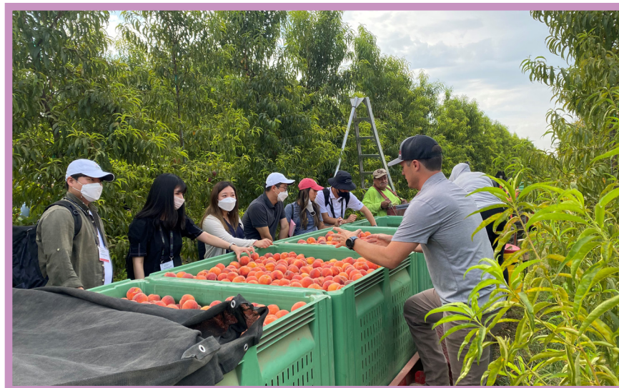
HMC Farms hosts buyers from Korea for a tour as part of a Reverse Trade Mission.